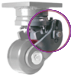
Clamp Side Adjust Caster