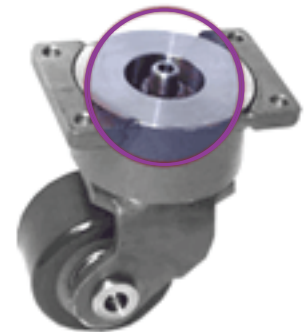
Top Adjust Caster